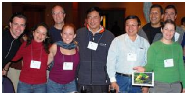
Rally 2008 Coaches celebrate their team's winning "art work."

Rally 2010 will be dedicated to enriching our skills to facilitate key aspects of the adaptive management framework in the face of increasingly challenging global contexts (strategy development and measuring effectiveness). You will also