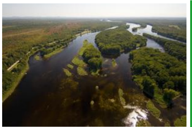
The Penobscot, Maine marshes.

What can "break the back of a swathe of bureaucratic processes holding up delivery of real action"? According to Mark Anderson (Chief Executive, Greening Australia), the answer is Conservation Action Planning (CAP). Greening Australia/South Australia (GASA) is working with partners to implement goals from the WildEyre CAP across three million acres (1.2 million hectares) on the Eyre Peninsula of South Australia. The region contains some of the largest, intact and contiguous areas of bushland in South Australia's agricultural districts, including spectacular coastal land forms and nationally threatened plant and animal species. To date, approximately $500,000 in external funding has been secured for the start-up of the WildEyre CAP strategies plus significant in-kind contributions from participating organizations. In total, an