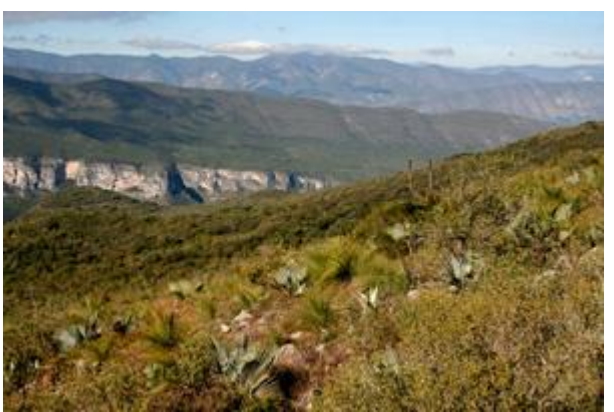
El Cielo Reserve