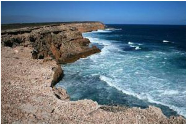
Wild coast line in WildEyre, Australia project area.

estimated 30M of funding will be required over the next 20 years to achieve the WildEyre vision. Greening Australia Coach Todd Berkinshaw, who has led the introduction of CAP into South Australia, says the process has fundamentally changed GASA's relationship with other conservation agencies and between key non-government and government organizations. "CAP has provided us all with a clear vision for what conservation success looks like and what our roles are in achieving that." Todd said. "No longer are we jostling for a position in the conservation of threatened species and natural landscapes but rather working together towards common goals." For more information on the WildEyre conservation project or GASA, contact Sam Catford at <u>SamCatford@GreeningSA.org.au</u>.