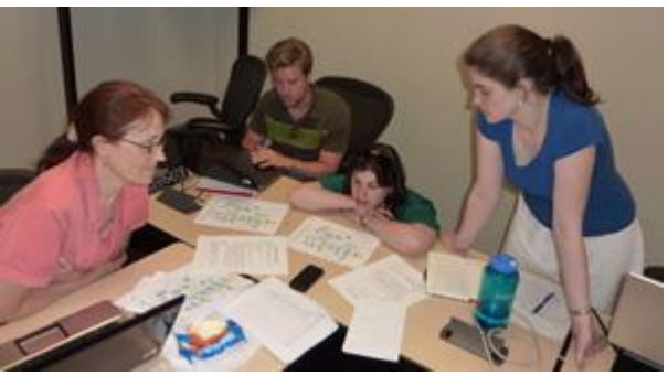
Training the next generation of professionals.

Do college students in your region have access to a course in conservation planning that is based on the Open Standards for the Practice of Conservation/CAP? Since 2007, Conservation Coaches Network (CCNet) partner Foundations of Success (FOS) has been working with a group of universities to pilot this type of course for graduate