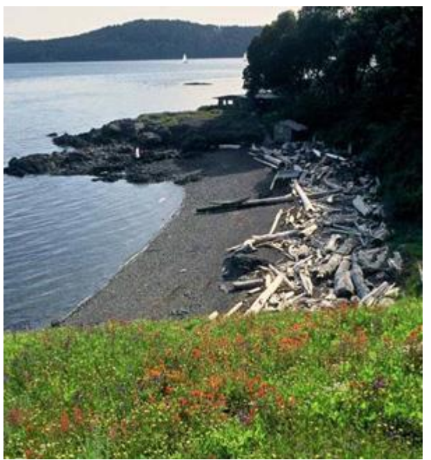
BLM manages some of the San Juan Islands.

government and NGO representatives, university experts and private ranchers, the coaches helped the partners share