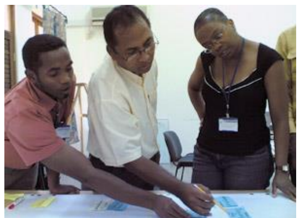
Training WWF standards in West Africa.

than 40 coaches across the WWF network. Trainings have recently been completed with WWF offices as far afield as China,