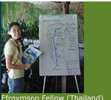
Efroymson Fellow (Thailand) sharing her team's target map