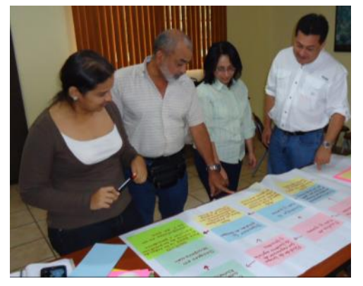
Participants learned how to apply the OS steps to conservation projects in Panama.