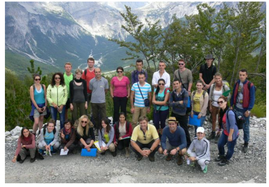
Students from across the Balkans learned how to use the MARISCO method to manage protected areas in the region. The students formed meaningful partnerships that will aide trans-boundary projects in the future.

Workshop organizers: The German Centre for Econics and Ecosystem Management (established by the German "Eberswalde University for Sustainable Development" and the British Writtle College); four universities in Albania, Kosovo, and Montenegro