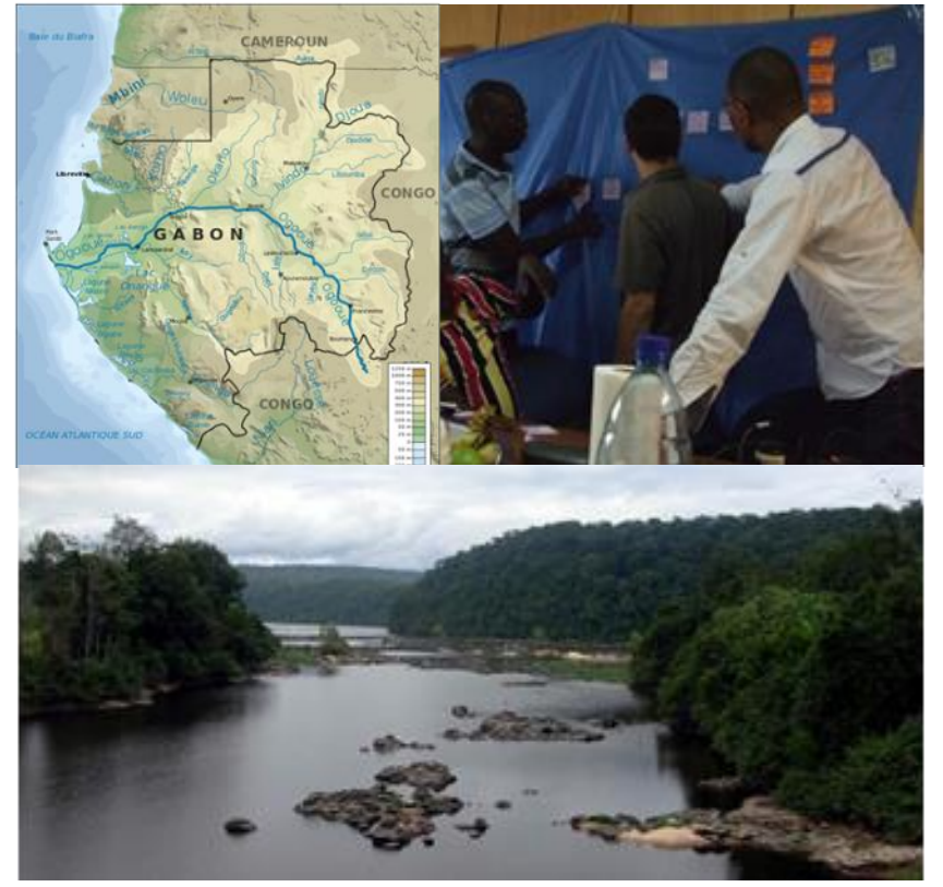
WWF Gabon staff outlined a conservation plan for the picturesque Ogooue River basin during a recent workshop.

The rich estuaries and swamps of Gabon's Bas Ogooue region are home to large populations of manatees, hippopotamus, and mandrill. To protect these and other critical resources, the government of Gabon reached out to WWF Gabon to help develop a feasible conservation plan for the Bas Ogooue landscape. The plan is needed to guide the expenditure of funds recently provided for conservation work in the region by the Africa Development Bank.