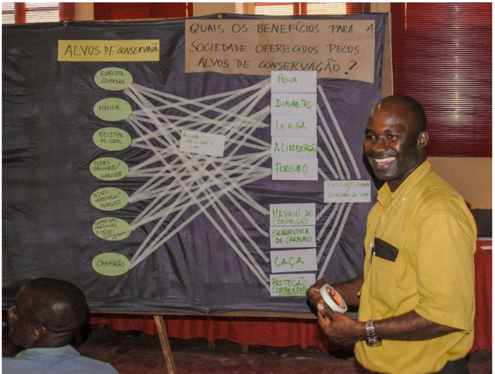
Volunteer coaches and participants identified critical connections between the needs of the community and the health of the natural systems.