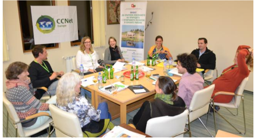
One of the workshop teams hashing out the first two steps of the Open Standards.

Multi-team workshop organizers: CCNet Europe; Bulgarian Biodiversity Foundation