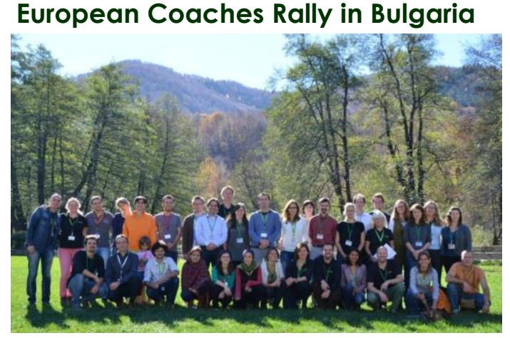
European coaches gather at the Rally.

With a clearer understanding of how to incorporate climate change issues and risk assessments in conservation planning processes, these students are better prepared to become the next generation of conservation leaders in their regions. Partnerships forged during the workshop will also facilitate trans -boundary conservation efforts in the Balkans. The workshop was also a valuable opportunity for the coaches-in-training to practice their leadership and teaching skills.