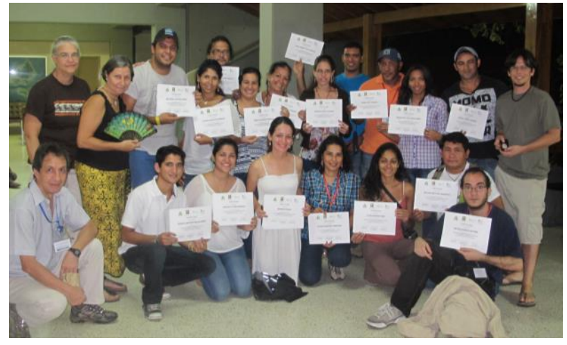
Students of the first course of Management of Protected Coastal-Marine Areas in Venezuela.

Venezuela. New Coastal-Marine Protected Areas Management Course Informs Conservation Plan for Margarita Island.