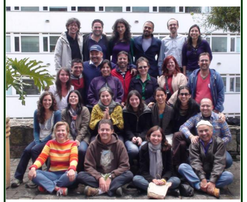
Participants at the first OS training in Spanish came from all over Latin America.

In August, three instructors and 20 students from across Latin America came together at the first Spanish version of the CCNet's Coaches Training. The groundbreaking four-day event laid the foundation for constructing a cadre of coaches who will be able to service South American conservation projects and teams in the near future. Coaches made good use of newly translated Open Standards training materials during sessions held at the Los Andes University in Bogota, Colombia.